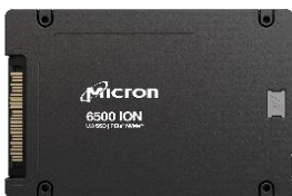
Micron 6500 ION 30.72TB SSD Available in U.3 (15mm) and E1.L (9.5mm)

For data centers that need to affordably scale storage density, the Micron 6500 ION is the answer.